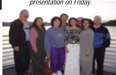
Lockheed Martin MSC Bay Area Chapter members pose with their Speech Contestant after the winners were announced on the dinner cruise.