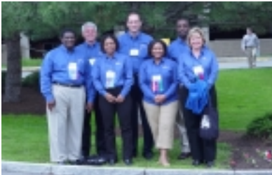
Members from ACIPCO, Birmingham, AL, pose for the photographer! They will host the 2004 Southeast/Northeast Leadership Conference in Birmingham!