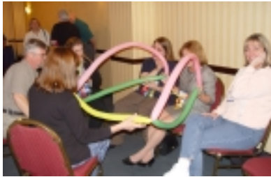
Teamwork at its best! First Time Attendees at the Northeast/Southeast work together to create some "unusual" art!