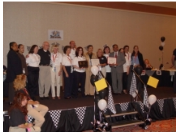
BCBSM Management Association are honored for all their accomplishments during the past year!