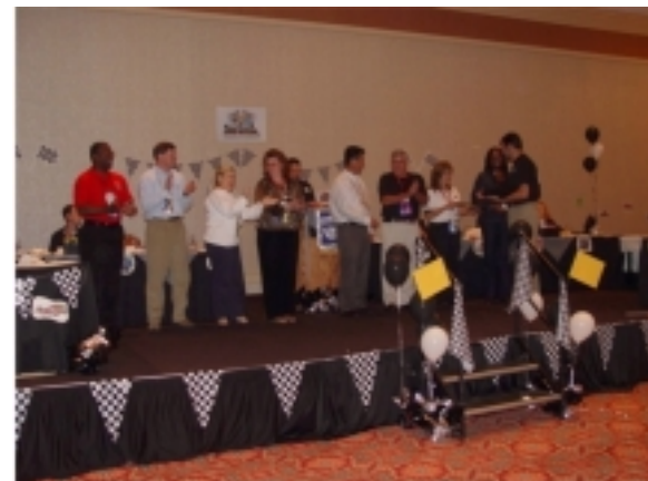
Trial Membership Campaign Top Achievers recognized for their hard work!