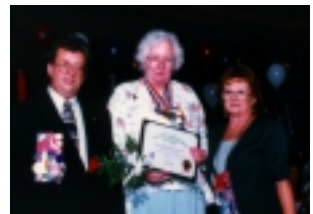
Avis accepting chapter award at NMA's 1996 National Conference in St. Louis